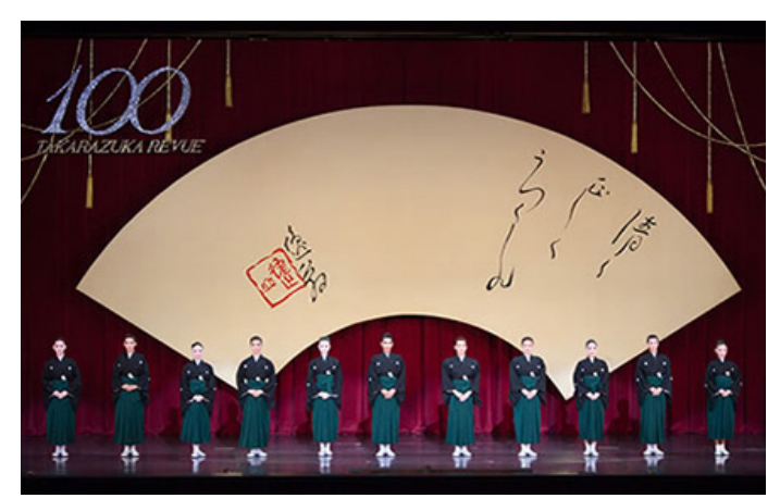
Takarazuka Revue Hundredth Anniversary Chorus (2014)