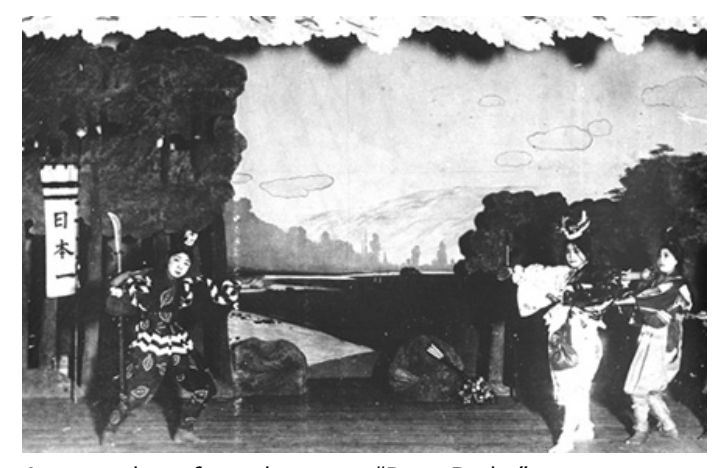
A stage photo from the opera "Dom-Brako"